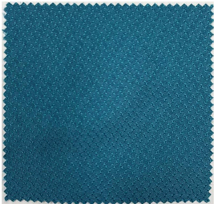
NEW DELHI M_607